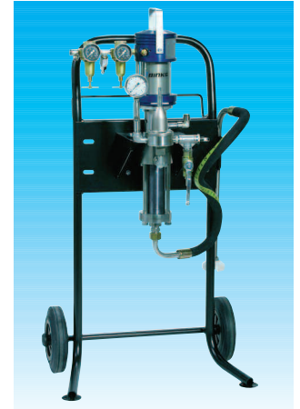
0014-1004F-AC - Cart Mounted outfit

Cylinder & Piston *Hardened St Steel construction – provides longer working life